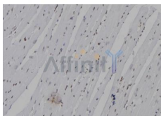
DF7077 at 1/100 staining Mouse heart tissue by IHC-P. The sample was formaldehyde fixed and a heat mediated antigen retrieval step in citrate buffer was performed. The sample was then blocked and incubated with the Ab for 1.5 hours at 22°C. An HRP conjugated goat anti-rabbit Ab was used as the secondary Ab.