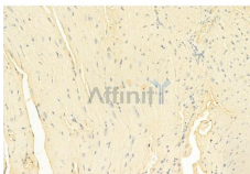
AF7088 at 1/100 staining Mouse heart tissue by IHC-P. The sample was formaldehyde fixed and a heat mediated antigen retrieval step in citrate buffer was performed. The sample was then blocked and incubated with the primary Ab at 4°C overnight. An HRP conjugated anti-Rabbit Ab was used as the secondary Ab.

IMPORTANT: For western blot, incubate membrane with diluted primary Ab in 5% w/v milk , 1X TBS, 0.1% Tween@20 at 4°C with gentle shaking, overnight.