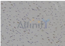
DF7539 at 1/100 staining Rat heart tissue by IHC-P. The sample was formaldehyde fixed and a heat mediated antigen retrieval step in citrate buffer was performed. The sample was then blocked and incubated with the Ab for 1.5 hours at 22°C. An HRP conjugated goat anti-rabbit Ab was used as the secondary Ab.

IMPORTANT: For western blot, incubate membrane with diluted primary Ab in 5% w/v milk , 1X TBS, 0.1% Tween@20 at 4°C with gentle shaking, overnight.